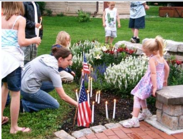
Town residents placed lit candles at the Rocky Ripple Veterans Memorial during Monday's ceremony for Rocky Ripple veterans.

Meet at the Town Hall Saturday June 19 at 3 p.m. The program ends at 5 p.m. Download the Turtle-Time flyer